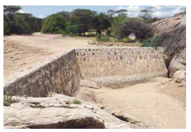
Sanddam, Kalemngorok, Turkana