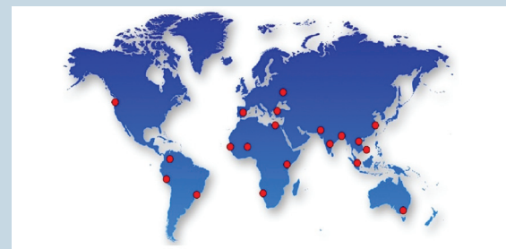
Figure 1. Location of Participating Water Utilities