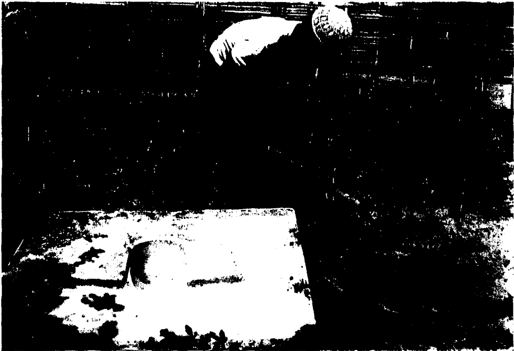
Making a pit latrine.