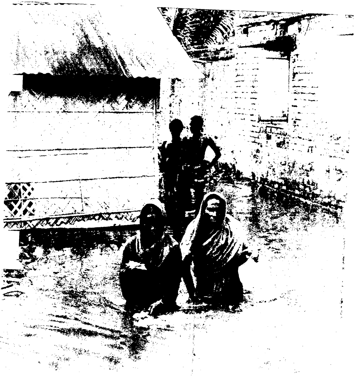
Women carrying food during a flood.