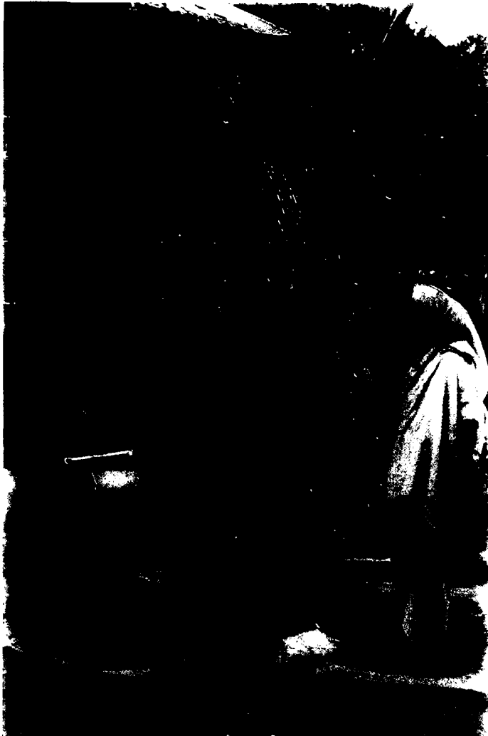
Rural women volunteers maintaining a Tara handpump.