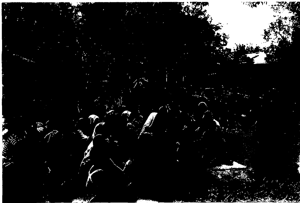
A community meeting on hygiene education.