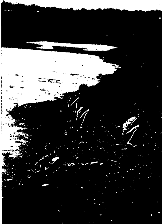
Indiscriminate defecation: a persistent problem.