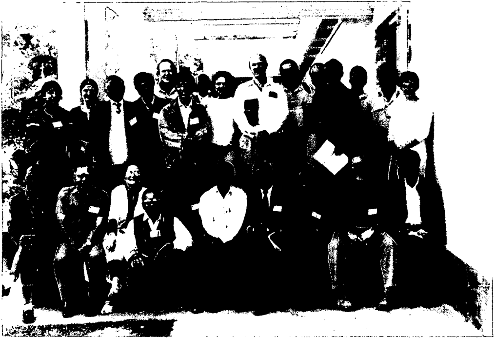
"Water and Sanitation Priorities for 1990's": Workshop participants.