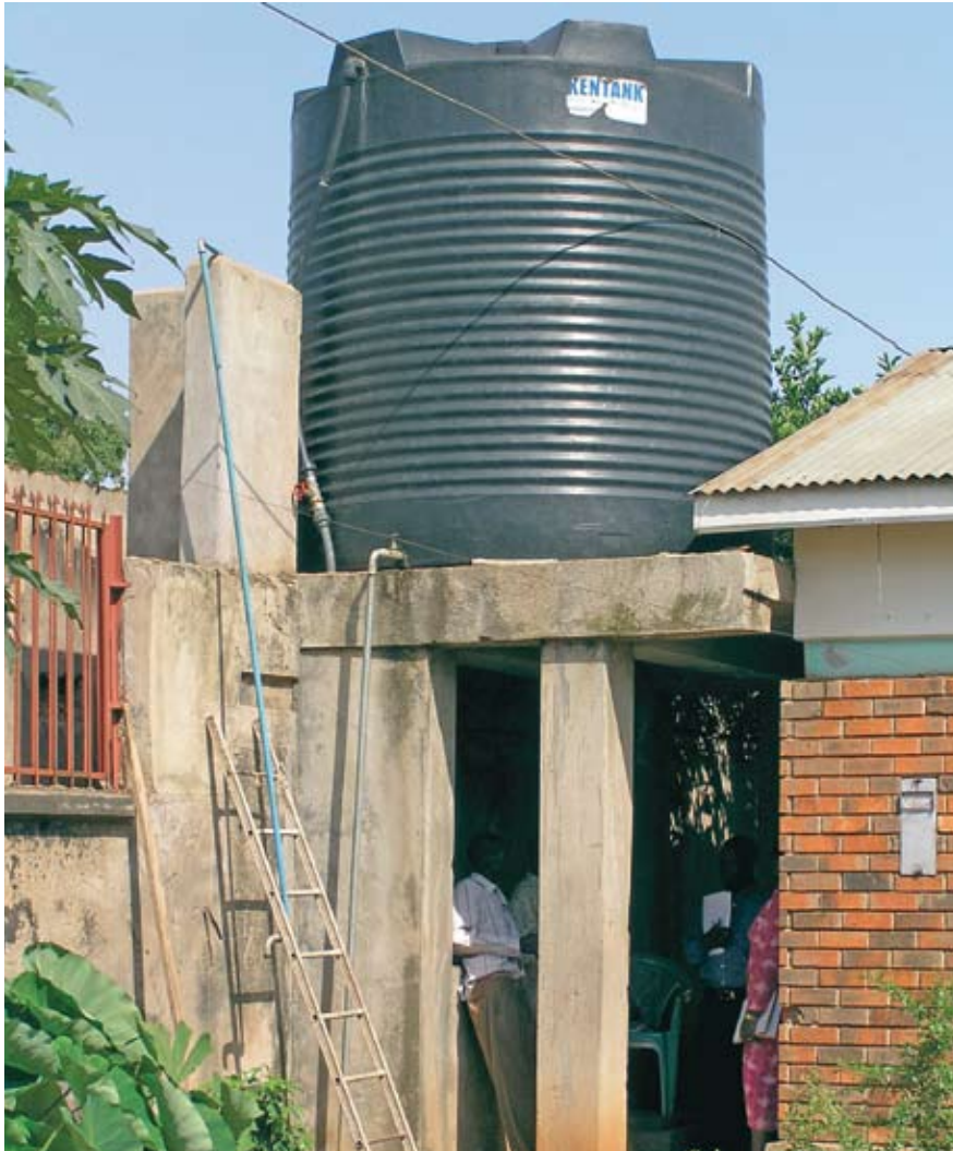
Self supply borehole and overhead tank

'safe/unsafe' or 'improved/unimproved' needs to be replaced by a ladder of improvements leading to minimum acceptable coverage and beyond.