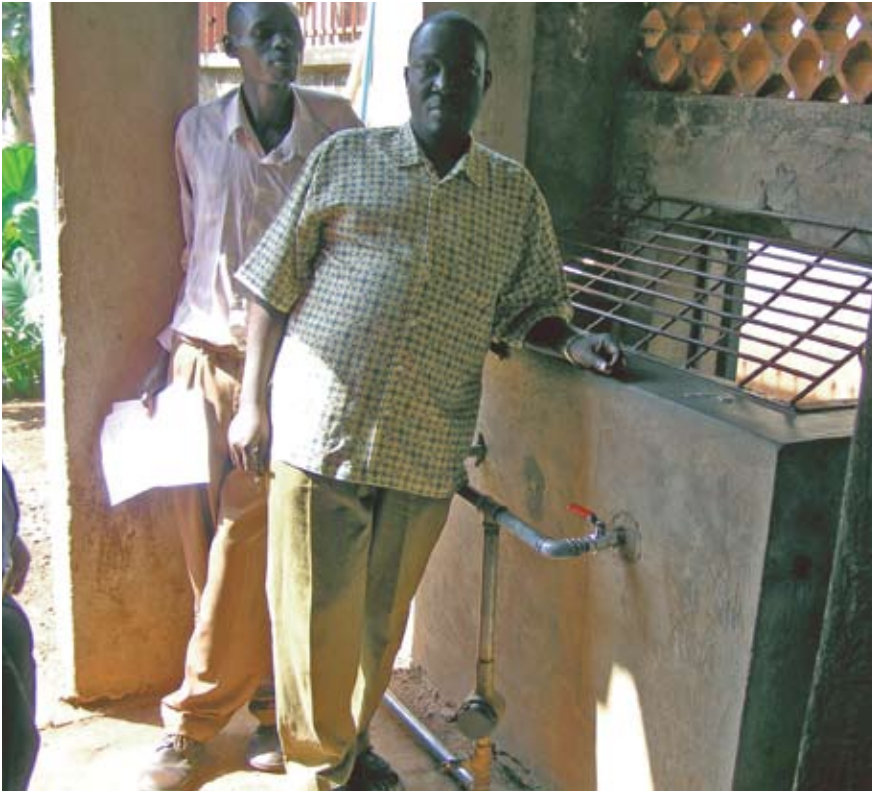
Water sale kiosk at self-supply borehole

and with representatives of the NGO sector and the main bilateral donors) has selected a small number of Ugandan NGOs to promote and support self supply. In the pilot, water users will be encouraged to make incremental improvements to their existing water sources. The implementing NGOs will assist communities through provision of technical skills and small subsidies in cash or kind. The technical adviser will provide orientation and back-up support to the NGOs. The NGO network (UWASNET) will channel funds to the NGOs, and sit on the Steering Committee. WaterAid will be a member of the Steering Committee. The Directorate of Water Development will