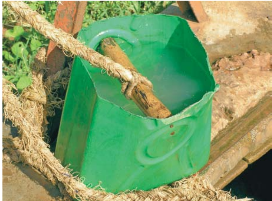
Simple technology rates highly in terms of both cost-effectiveness and independence of management

between water users (interested primarily in accessibility, reliability, ease of maintenance and affordability) and water supply professionals who discourage development of sources that fall short of Government standards need to be constructively aired and addressed. It is understandable that sources which fall short of Government standards of construction quality, are verbally, if not actively discouraged by the authorities, given the desire of Governments and NGOs to protect their served populations from the dangers of poor quality water. It is even conceivable that litigation could follow (as has been the case with arsenic contamination in Bangladesh) if consumers were encouraged to drink water which was subsequently proven to have caused illness or