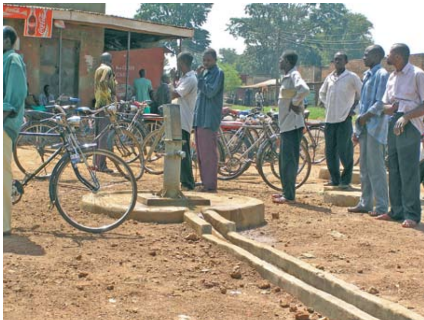
Ugandan small town borehole serving an extensive user community

Government statistics (MoWE 2006) estimate that just over 61 percent of Uganda’s rural population has access to ‘safe water’. The implications of this are that 39 percent of the rural population currently obtains domestic water from ‘unsafe’ sources. The findings suggest that the vast majority of these are type 1 and 2 sources – shallow scoops or water holes, with rudimentary protection (earth bunds, logs, stones, vegetation and live fencing), maintained entirely by the water users. A small percentage of the rural population may be served by shallow wells and boreholes (type 3 and 4) constructed on the initiative of private individuals, and another few percent are using rainwater for part or all of their needs. Consequently self-supply is of great importance in Uganda, and ripe for support and upgrading in a sensitive step-by-step manner.