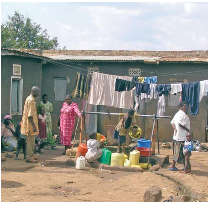
A communal well at a suburb in Bugiri town