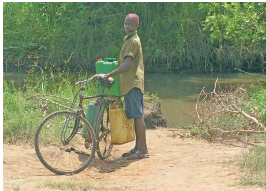
Distance is a limiting factor when scoring water sources for reliability and cost

In Uganda, the study found that water users sharing a ‘private’ well are typically unwilling to cooperate in terms of maintenance and payment. While owners comment on the fact that users fail to contribute, they appear largely accepting of this. Payment for water (by volume, or by monthly or annual charge) becomes increasingly acceptable as one moves from rural areas to trading centers to urban locations. In rural areas it is usually unacceptable, while in the