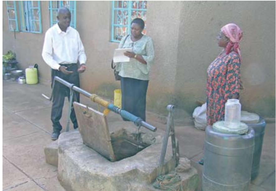
Self-supply well in Busia town

In the past, water sector professionals have either ignored or disapproved of self-supply initiatives. They still tend to focus on the perceived disadvantages – poor water quality and construction quality, unreliability and lack of safety – rather than the advantages to the users, namely ease of access, low cost, and ease of management. The conventional approach to water-supply provision is externally driven – by Governments, donors, external agencies and NGOs.