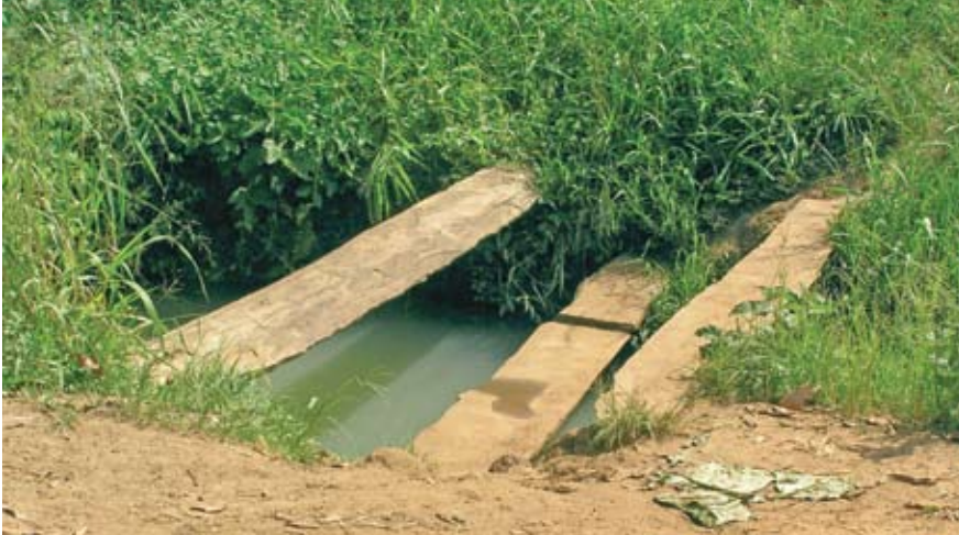
Valley bottom water source protected with timber and earth bund

their communities. At the poorer end are community members who mobilize their friends and neighbors to improve traditional water sources using local labor and materials.