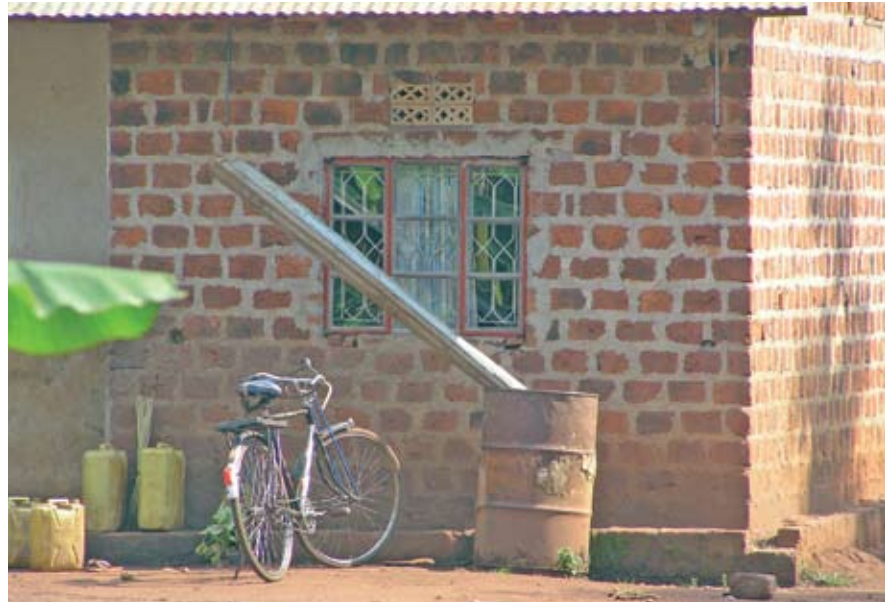
Domestic rainwater collection