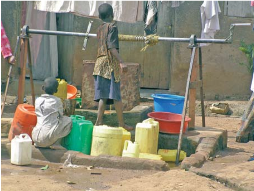
Self-supply well with windlass