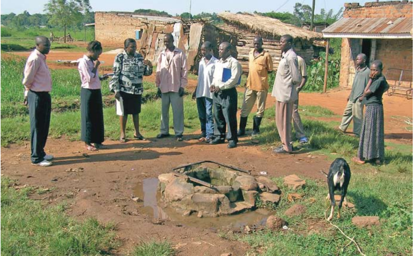
A hand-dug well in poor condition that is nonetheless easily accessible

In Zambia, detailed research into potential low-cost improvements to traditional water sources (1998-2002) led to piloting and capacity-building, and the incorporation of self-supply approaches into national policy (Sutton 2002).