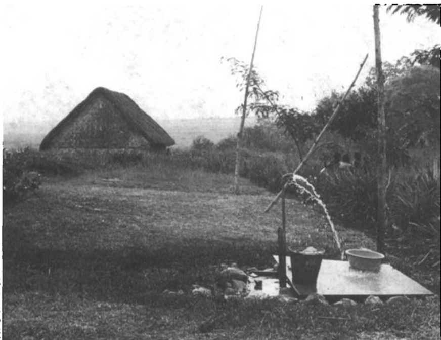
A clean, safe, convenient water supply will mean better health for this family in Papua New Guinea.

predicted, many of the imported solutions were either not appropriate to local socio-cultural or economic conditions, or exceeded the capacity of local authorities to operate and maintain. Concurrent with the preparation of the Decade and continuing throughout it, serious efforts were made to re-examine the feasibility of using improved traditional technologies and adapting more sophisticated ones to local conditions in developing countries. As a result of major efforts undertaken by ESAs and countries alike, today the project planner has a wide variety of affordable, sustainable technologies from which to choose in any given situation.