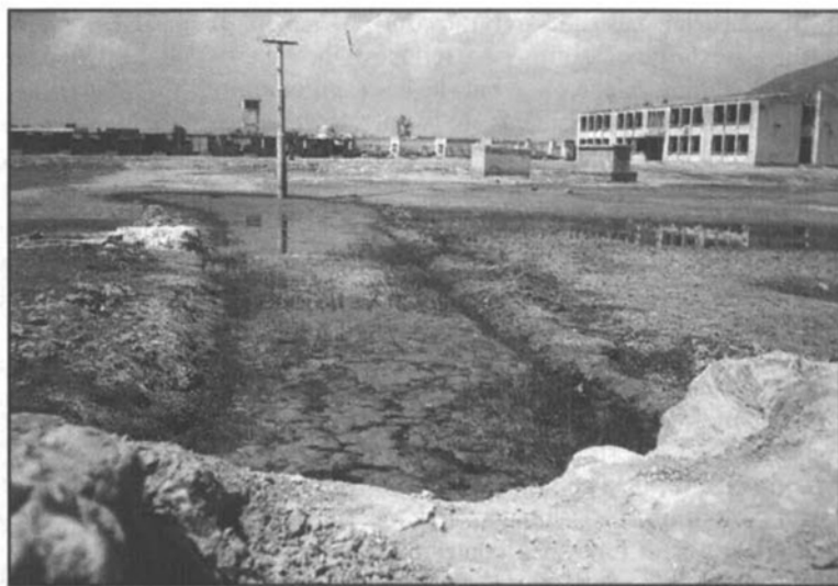
Drainage problems in the city provide ideal breeding-grounds for disease-carrying vectors.

overall aim to control communicable diseases. Groups of some of the most vulnerable women were shown how to make various health-related items (such as bed-quilts and mosquito nets) at home. For two weeks at a time each woman made up these items; she was then 'paid' with food, and allowed to keep a proportion of the goods. 1