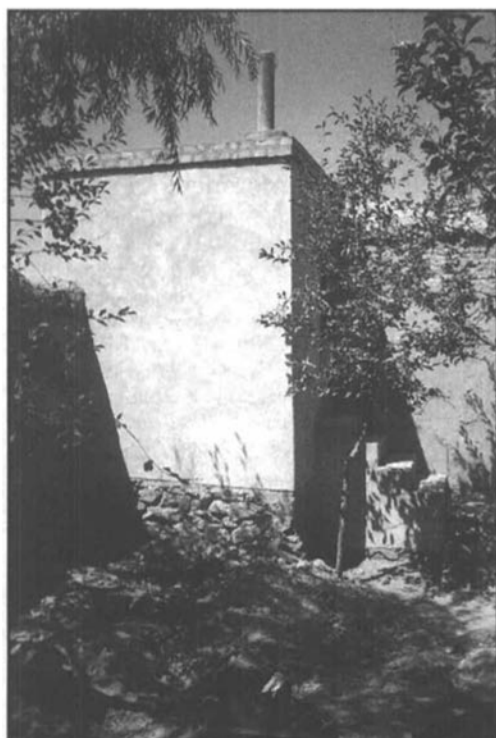
New latrines are constructed several feet above ground in areas with a high groundwater-table.

The component of the Integrated Programme-designated 'Home-Based Industries' (HBI) was able to integrate the immediate financial needs of many of these women with the programme's