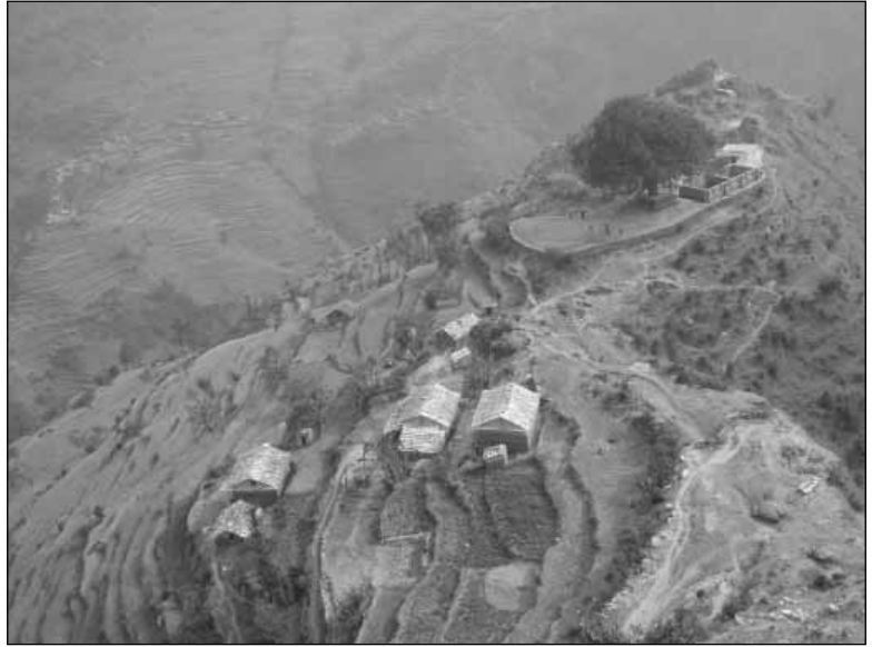
The remote village of Kamchada village, Nepal

Two years have passed of this three-year project which includes three major components: (rehabilitate) access to basic services; rebuild livelihoods for the poor; and strengthen community-based organizations. Hygiene promotion for men was a small but important element in the overall water and sanitation intervention. Health and sanitation facilitators are members of the community, hired for the project to carry out hygiene promotion activities and support the rehabilitation of basic services. The project covered four districts of Nepal: Doti and Achham of the far west region and Dailekh and Surkhet of the mid-west region.