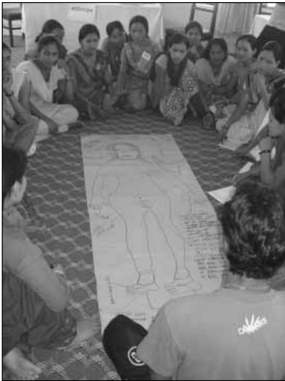
Body mapping exercise

The F-diagram is a tool for raising awareness on transmission routes of oral-faecal diseases, and drama