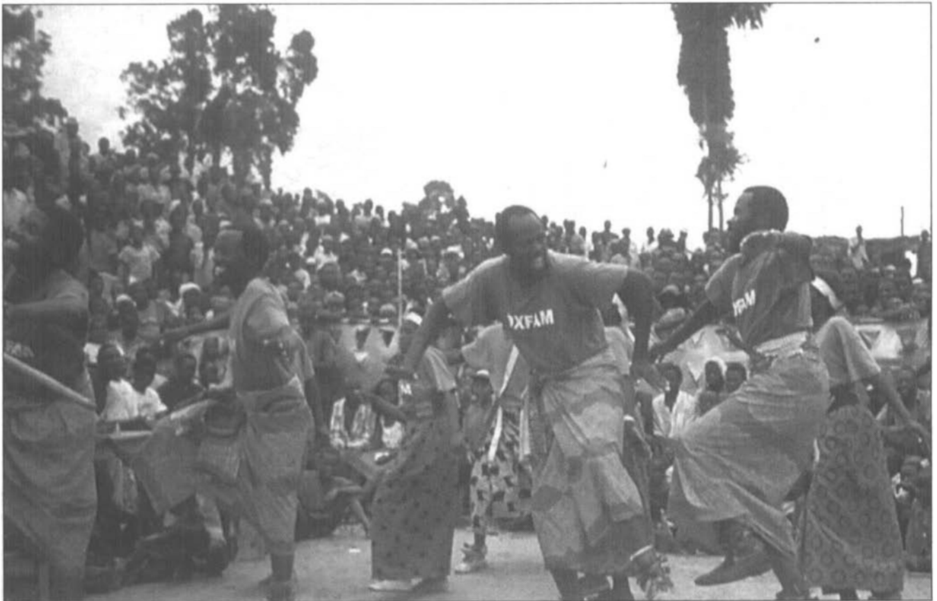
Despite the seriousness of the subject matter, a solemn approach to promoting better hygiene is not obligatory.

link between illness and dirty water. In Kahindo, 62 per cent of the population questioned, compared to only 2 per cent in Mugunga, mentioned latrine use as a means of avoiding diarrhoea — one of the principal messages promoted by the family latrine programme. But the importance of