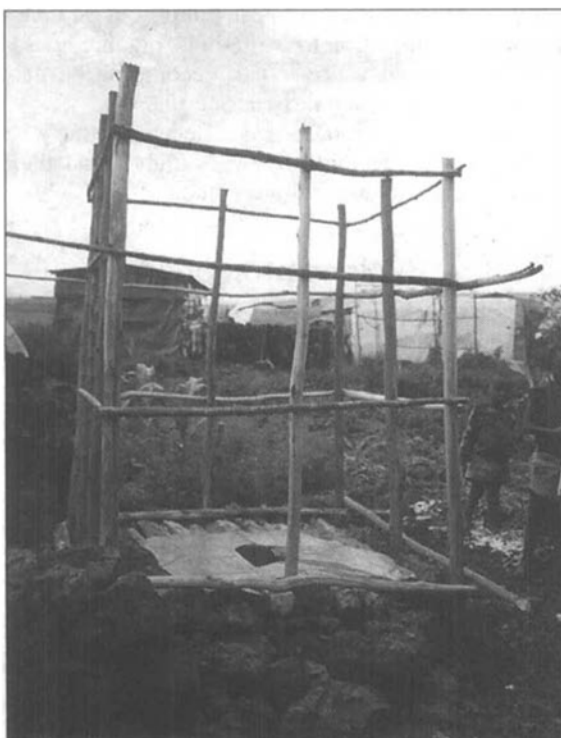
Family latrine construction. Some materials were provided by Oxfam; the family improved on the basic design with their own piece of sheeting.