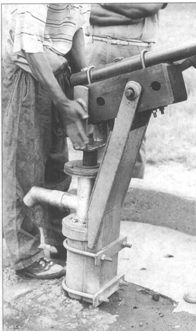
Final assembly of the pump after the 'down the hole' parts have been inspected. The whole operation of lifting the rods, inspecting and replacing the seals, and reassembly takes less than 20 minutes on a 30m-deep pump.

At first, some communities tend to view the pump with scepticism. When a community pump is 'converted' from an existing standard model to an 'extractable' model, there is a considerable reduction in water output. At their peak, 75mm cylinders can deliver 40 litres of water per minute, whereas the 50mm extractable system only delivers about half this amount. Initially, this can deter the users, but the advantages soon become apparent when the replacement of a seal is to be undertaken by the pump minder with community assistance. DDF staff are far more receptive, as conversion makes their own working lives easier.