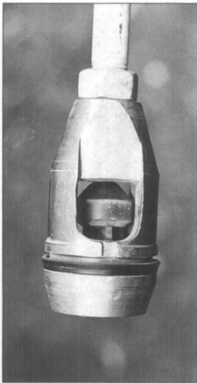
The brass piston assembly showing rubber poppet valve and seal in place.