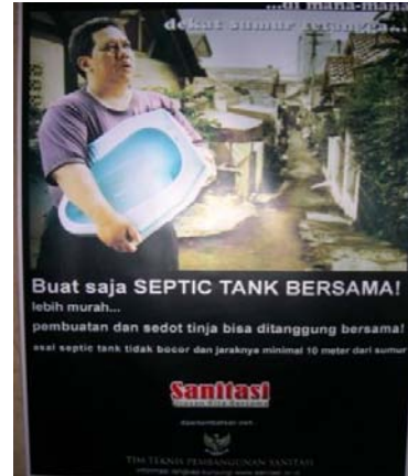
Figure 1 Men’s responsibility for their families

In addition, cities were encouraged and assisted to launch their own sanitation and hygiene promotion campaigns through the local media, or otherwise. In a number of cities a “pro-poor sanitation campaign” was conducted. In this campaign, city cadres assist men, women and children in the poorest neighborhoods to strengthen good and eliminate bad sanitation and hygiene practices. The pro-poor campaign does not use mass media, but personal contacts and participatory methods with women, men and children, because types of approaches are more effective with these groups.