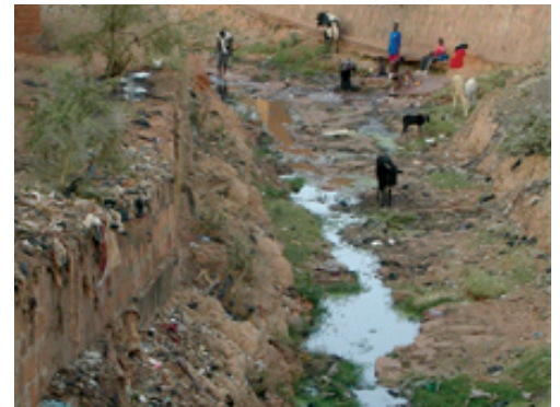
Well sited beside watercourse acting as drain and waste dump, Bobo-Dioulasso, Burkina Faso.

Sanitation has been incorporated alongside water supply in Target 10 of the Millennium Development Goals, and this signalled a greater recognition internationally. The WASH concept, promoted by the Water Supply and Sanitation Collaborative Council, argues for combining