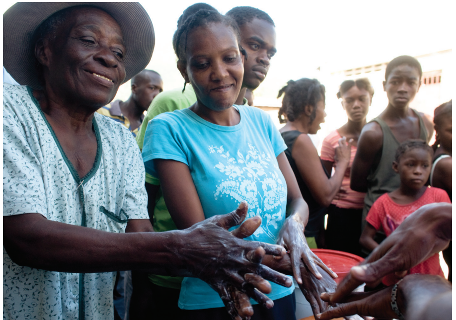
The Eawag research suggests that combining practical demonstrations of hand washing with distribution of hygiene materials has been an effective hygiene-promotion activity in Haiti.

For people affected by disaster, whether wars, earthquakes, or disease epidemics, conditions of life can change suddenly and in ways that require rapid adjustments. Often, adaptation includes taking greater care to prevent transmission of disease, in order to minimize the new threats to public health. Understanding what enables and influences changes in human behavior is key to developing and evaluating strong hygiene programs, so Eawag placed the issue—and the science—of behavior change front and center in its study.