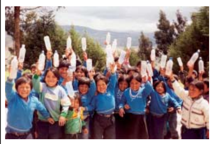
Fig. 5: Schools are an excellent entry point for introducing SODIS to a community