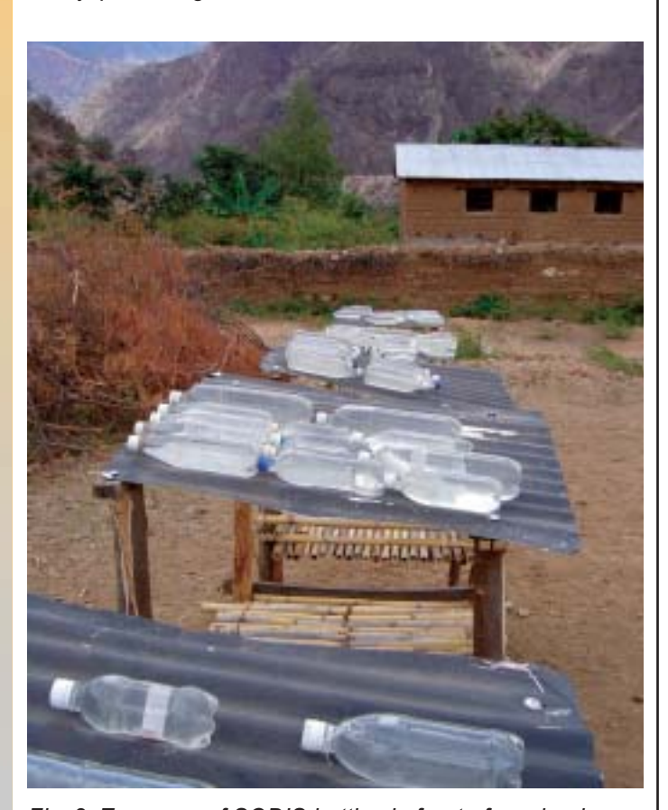
Fig. 2: Exposure of SODIS bottles in front of a school

The SODIS Foundation focuses its activities on training of trainers, technical assistance to the partner organisations, and lobbying activities with key players in the region. Since 2003, the SODIS Foundation has shifted its focus away from solely promoting the method of SODIS to the innovative