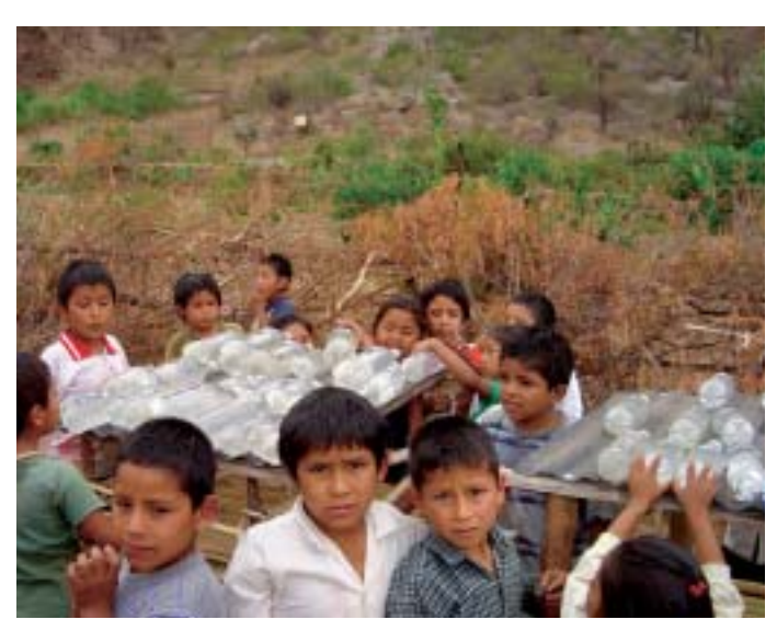
Fig. 4: All SODIS projects in Latin America reported a reduction of diarrhoea especially among children