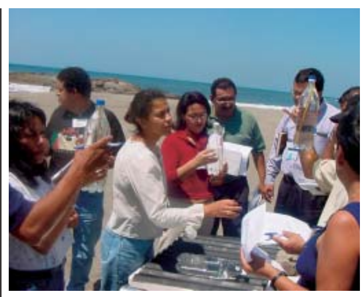
Fig. 3: SODIS Foundation provides technical assistance to partner organisations and trains trainers.

approach of 'Safe Water', which includes water treatment at the household level, safe water storage, and hygiene. When being offered a range of options for treating water, people can actively participate in the projects, and they can adjust the different options to their local needs and customs.