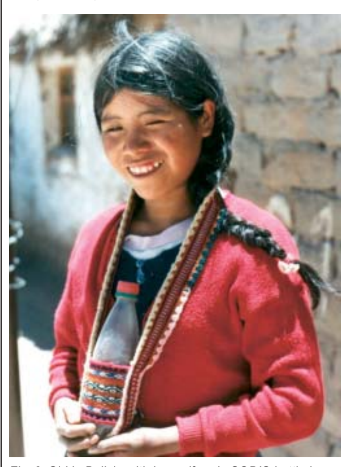
Fig. 6: Girl in Bolivia with her selfmade SODIS bottle bag

The strategy of forming and strengthening a network of partner institutions instead of building up another independent NGO has proven very successful for the SODIS Foundation. It has enabled the partners to exchange experiences and coordinate their work, which in turn has brought about good results in the field.