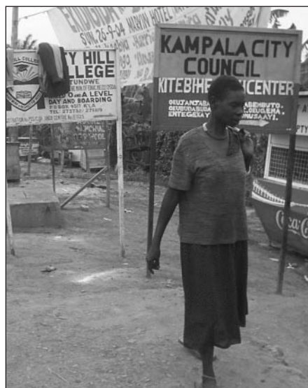
Sometimes valve boxes had to be constructed in congested parts of Kampala