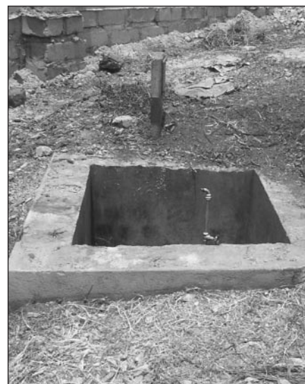
Innovative engineering solutions were needed for installing this valve box in a hilly and sandy terrain