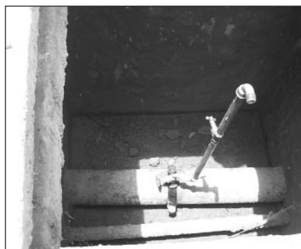
Newly installed copper sampling pipe and tap