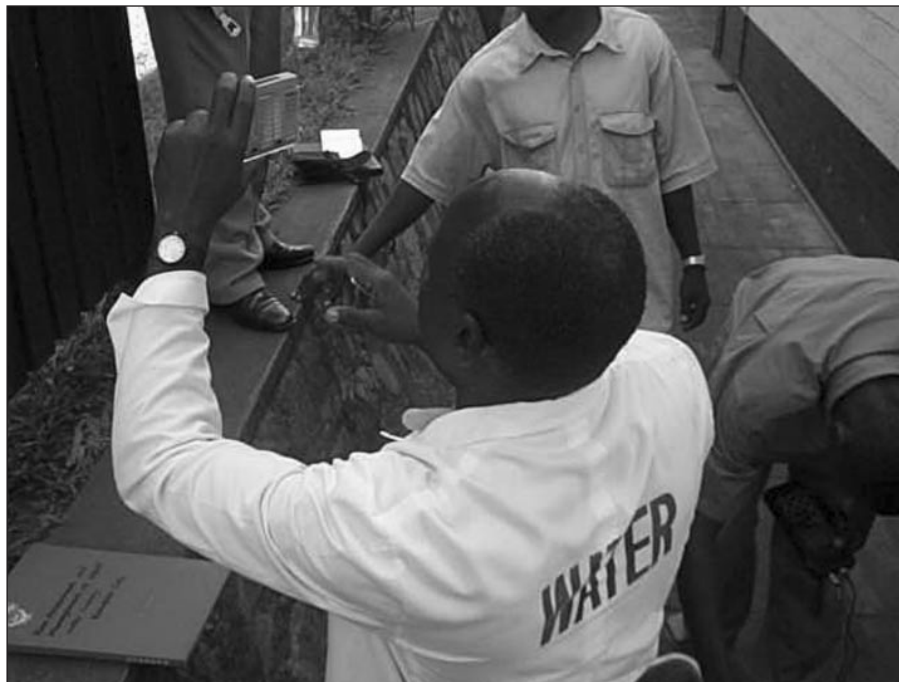
Water-quality monitoring now involves operations staff