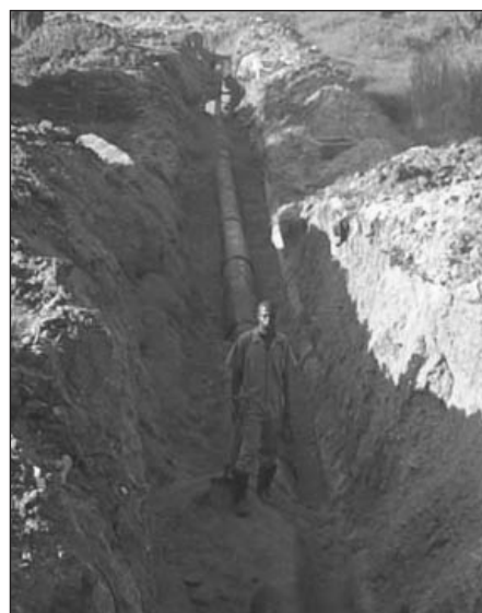
Extension to the pipeline

Quality monitoring. In conventional monitoring approaches, the responsibility of quality monitoring was upon laboratory or quality department staff. With the WSP approach, operations staff are more involved in monitoring and they are therefore able to respond more quickly to problems identified in the system. This in turn results in a reduction in unaccounted for water from leakages as spots with frequent bursts are monitored regularly.