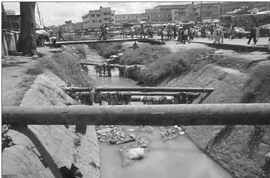
Piped water in the centre of Kampala, Uganda

Step 6: Development of water-safety plans. Using information and data collected during the system assessment and description, WSPs were developed for each individual point from water works to distribution. WSPs were developed for each stage of water treatment as well as at a number of primary and secondary valves, service reservoirs, supply tanks and stand-pipes.