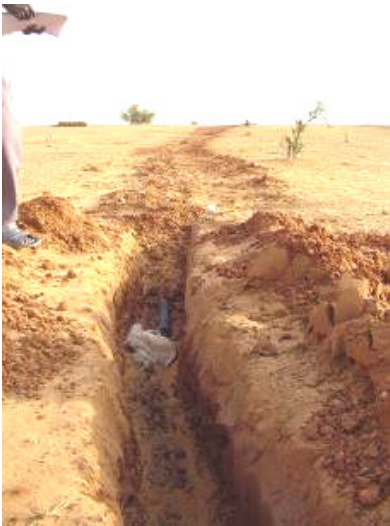
Although taken in Mauritania, this photo shows how providers can often lower costs by not adhering strictly to norms and standards, yet still provide an affordable quality service.