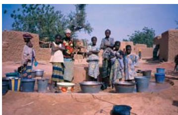
Women and children gather at a community water supply in Mali to collect water for household use.

"The conference agreement includes Senate language that provides $100,000,000 shall be made available for drinking water supply projects and related activities. The managers expect USAID to report no later than 90 days after enactment of this Act on funding and implementation of its water projects, including the number and location of wells drilled, and the cost per well."