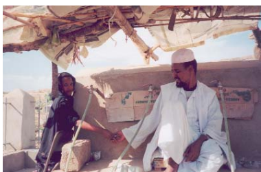
A young girl makes a small payment to collect safe drinking water from a community water supply facility in Eritrea.