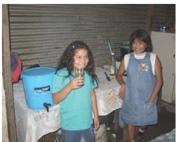
Through the Safe Drinking Water Alliance, USAID helps disseminate the use of low-cost solutions to improve the quality of existing household water used for drinking and cooking.