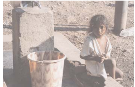
Improved water supply and sanitation enhance child survival by reducing the incidence of waterborne diseases.