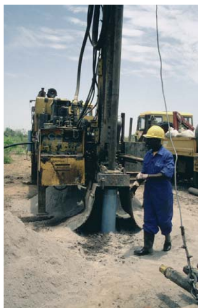
Well drilling in Ghana, Mali, and Niger is an important entry point activity for improved integrated water resources management objectives of the West Africa Water Initiative.

Eight countries have reported data on well drilling activities during the first half of FY 2004 (Table 2). A total of 497 wells have been drilled since October 1, 2003 in Eritrea, Ethiopia, Ghana, Senegal, Jordan, Serbia, Paraguay, and Ecuador. The average cost per well is $4,342, and includes boreholes, dug wells, developed springs, and improved technology traditional wells. The resulting number of wells completed by the end of FY 2004 will be higher than 497, which represents available data on mid-year progress to date. For example, an additional 1,700 wells are planned for development under a rapid delivery assistance project in Afghanistan prior to the end of FY 2004, at an average cost of $900 per well. In many instances, additional wells have been drilled using leveraged partner funds and are not included in Table 2 as results of direct USAID funding. For example, approximately 46 wells in Ghana and Mali have been developed since the onset of FY 2004 through the USAID-supported West Africa Water Initiative.