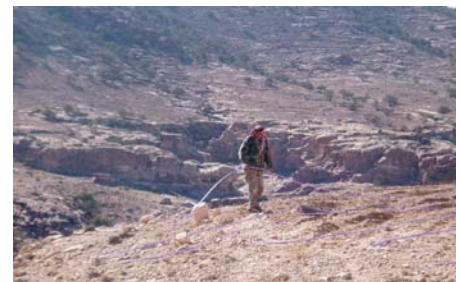
Extreme water scarcity and increasing cost of supply are serious constraints to Jordan's economic growth. USAID helps Jordanians meet water needs for urban consumers, industry, agriculture, and tourism.