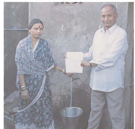
USAID's Development Credit Authority (DCA) uses partial guarantees to help mobilize local capital for investment in financially viable water delivery infrastructure. This couple shows a copy of their first water bill they have received since obtaining a household connection to a municipal water delivery system funded with a DCA partial guarantee.