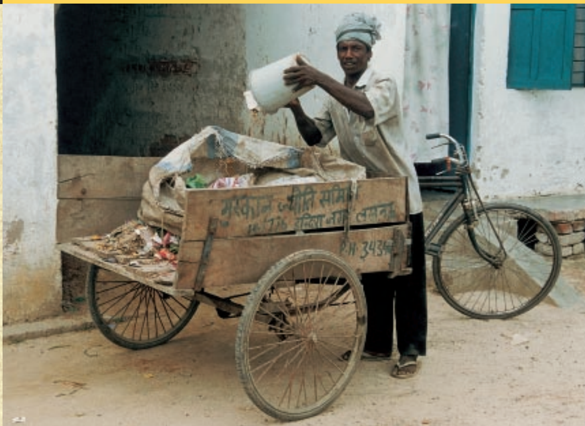
Household waste collection