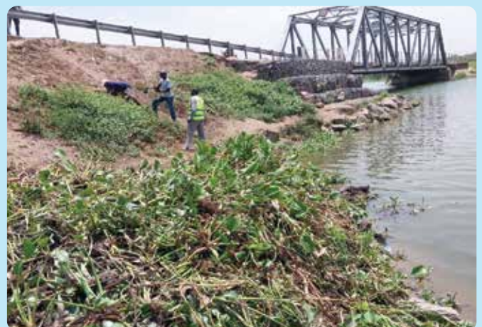
Dialoguing on water resource challenges experienced in Katunguru and water hyacinth was major issue