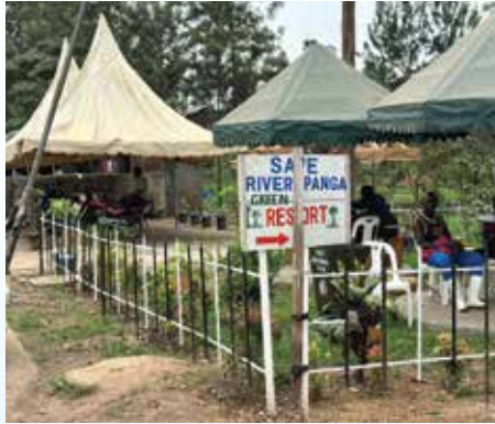
One of the areas near Mpanga market which was cleaned during ARWEWK 2023 currently turned into a relaxation shade for the vendors