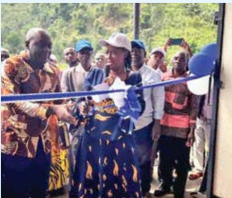
Hon. Kambale Feligo and Hon. Aisha Sekindi during the commissioning of the coffee processing unit in Kasese