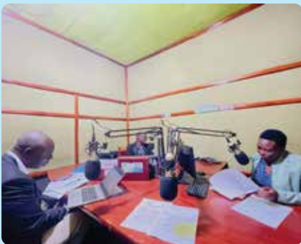
Awareness creation on conservation & sanitation through radio talk shows

bank stabilization, afforestation/re-afforestation among others. Some of the listeners' concerns were in line with access to safe water whereby they demanded the Ministry's intervention to extend piped water systems. The public was urged to participate in the lined regional water and environment week activities and to continuously conserve the water and environment resources in their capacities.