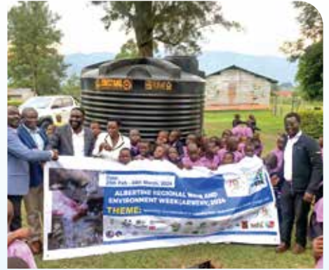
During the handover of a 10,000 ltr Rain Water Harvesting Tank to Bukuku Primary School