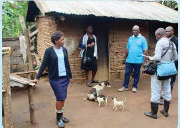
(Left-Right) Kabarole District Health Inspector, IRC Regional Wash Officer, MWE Sociologists during a household inspections in Kichwamba