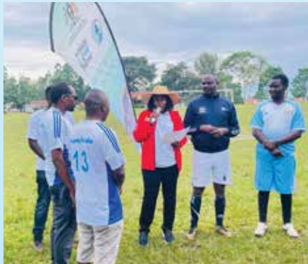
Pride Microfinance Team awarded certificate for participating in corporate games for WASH