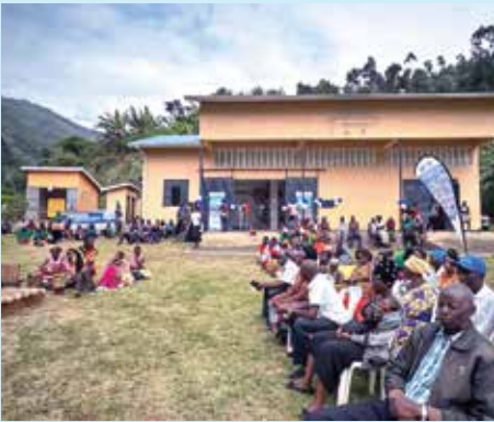
During the commissioning ceremony in Kasese