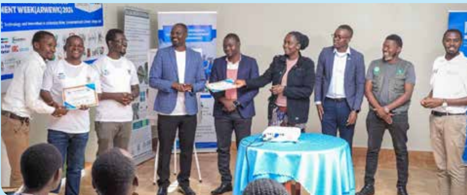
Certificates awarding to hackathon participants