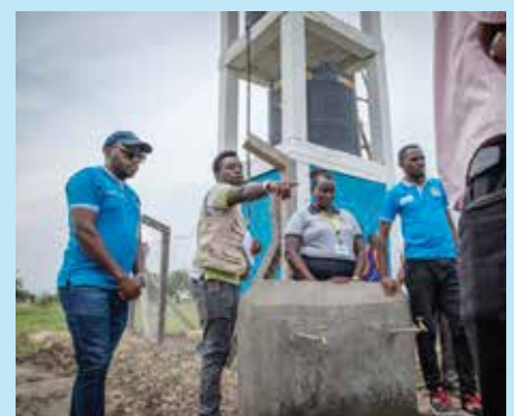
MWE and partners during inspection of the ecosan toilet & solar powered water supply system in Ntoroko District