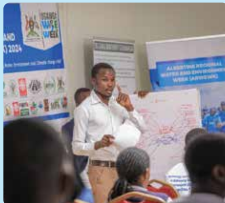
Fins University emerged as a champion in presenting the Biocycle Urban Energy Model to address urban waste mismanagement