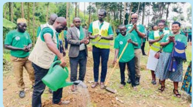
Manager- UWS-MW during ceremonial tree planting aimed at source protection