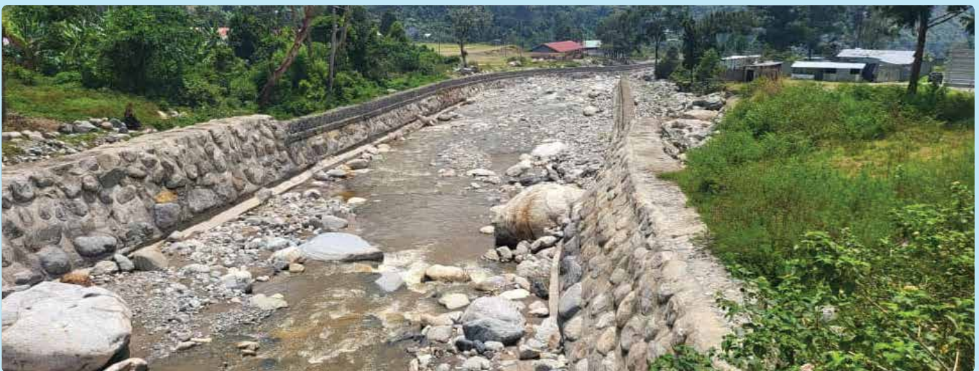
Implemented structural measures in Nyamwamba upstream to contain the adverse flooding effects