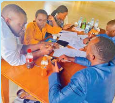
Hackathon participants were technically supported by MWE Officers and partners before their presentation to the judges

After rigorous presentations and judging, FINS Medical University emerged as the champion, showcasing its Bicycle Urban Energy Model to address urban waste mismanagement. The hackathon not only encouraged innovative problem-solving but also provided a platform for collaboration, learning, and the integration of youth-led solutions into sector planning for a sustainable future.