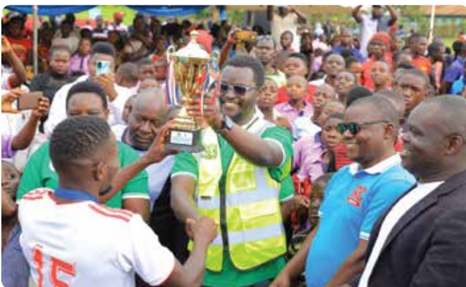
The Team Leader AWMZ handing over the trophy to Bwanika FC

from Deuteronomy 23:11. By stating that "a dirty person cannot be my friend," she stressed the importance of cleanliness not only for individual health but also for fostering meaningful connections with others. Aligning personal hygiene with minimized medical expenses, she urged for a collective commitment to prioritizing cleanliness as a cornerstone of well-being and community togetherness.