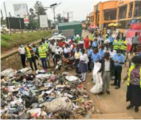
During the cleanup exercise at Mpanga market in Kabarole as walkers traversed Fort portal