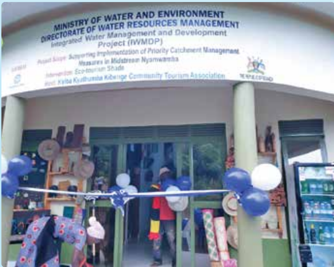
During the commissioning of one of the 3 constructed ecotourism shades in Nyamwamba catchment