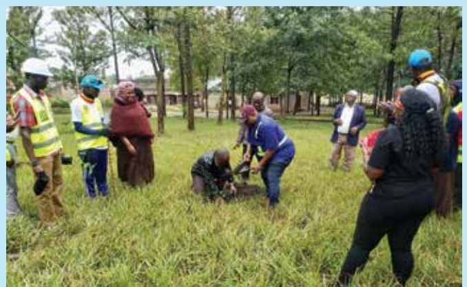
(Left)Hima T/C, Kasese DLG ,Walkers and MWE Officials during the dialogue and ceremonial tree planting (right)

A nother gathering was held at Katunguru fishing landing site, uniting community leaders, environmental advocates, and government representatives in a shared mission for sustainable practices. Amidst the lively discussions, attendees emphasized the urgent need for solutions to pressing challenges, from the overgrowth of water hyacinth weeds to the