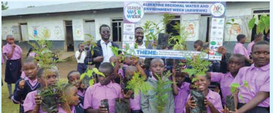
Tree seedlings were distributed during School outreaches to promote Environmental conservation