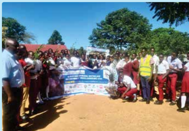
During the school outreaches in Kyegegwa