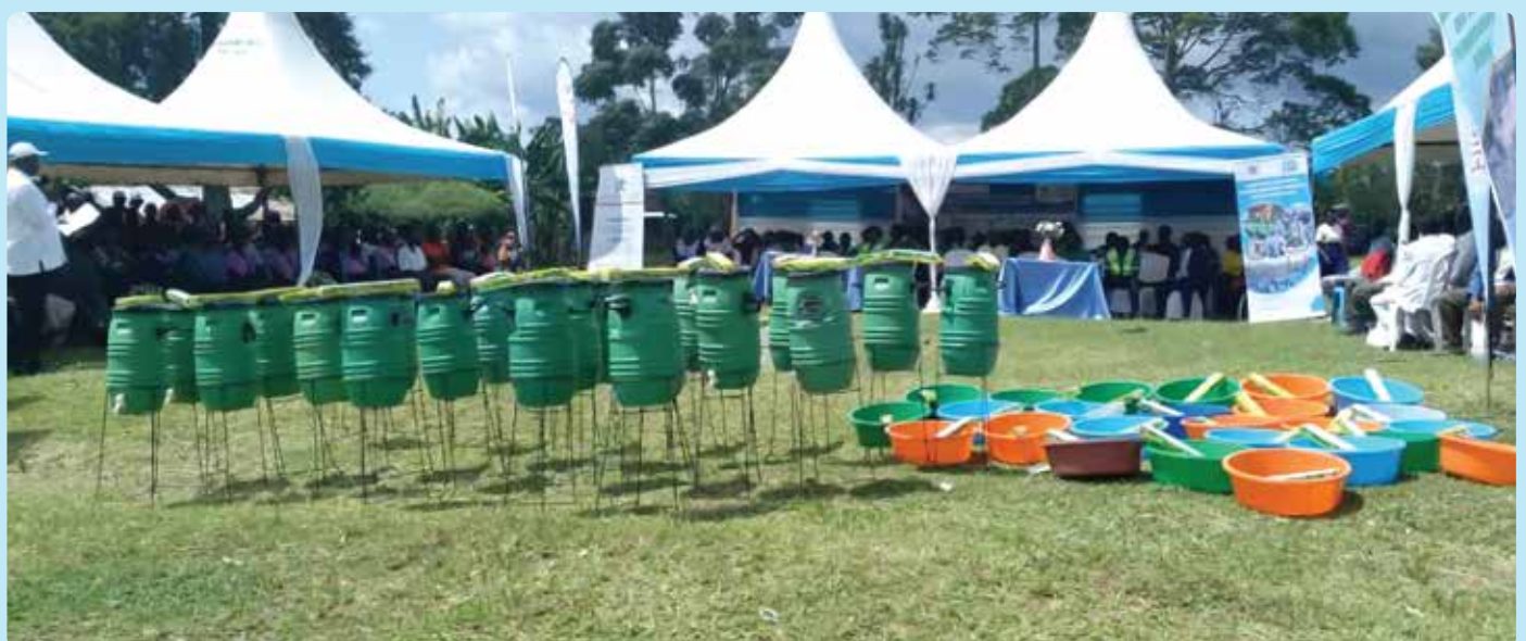
Hygiene and sanitation items that were awarded to the model homes