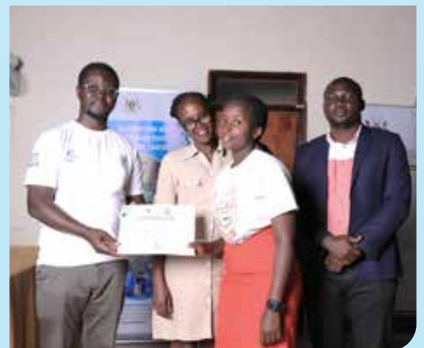
Certificates were awarded to the debaters