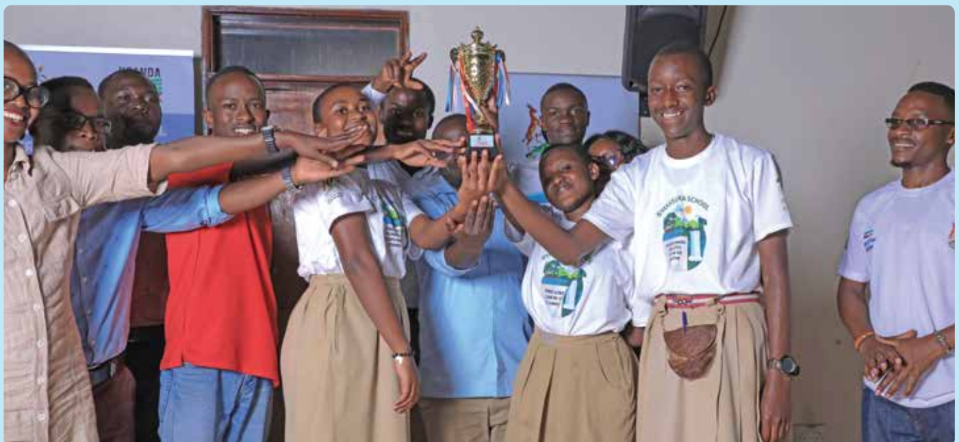
Nyakasura School awarded a trophy after emerging the winners of