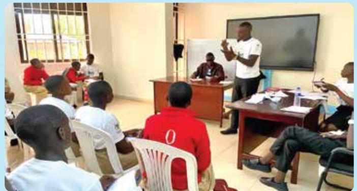
Students during the debates