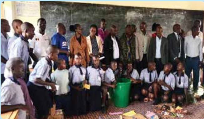
Students showcased innovations aimed at the promotion of sanitation, hygiene & environmental stewardship

Additionally, the occasion featured engaging performances by students, including music, dance, and drama segments that creatively highlighted water and environment-related challenges and proposed solutions. Notably, the event involved a symbolic tree-planting ceremony, signifying collective efforts to combat climate change and preserve natural resources. The participation of key personalities such as the RDC, CAO, LC5 Chairperson Kamwenge DLG, and Ministry Officials underscored the significance of the occasion and emphasized the importance of concerted action in safeguarding the environment for future generations.