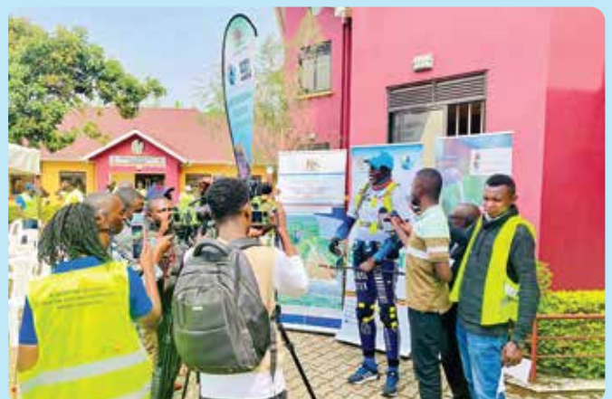
During the press conference at MWE regional office