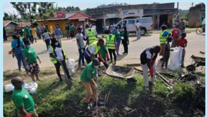
MWE and partners during the clean-up in Kichwamba