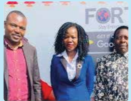
MWE hosted on Fort TV to inform the public about ARWEWK 2024