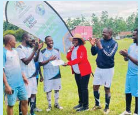
MWE Team receiving certificate