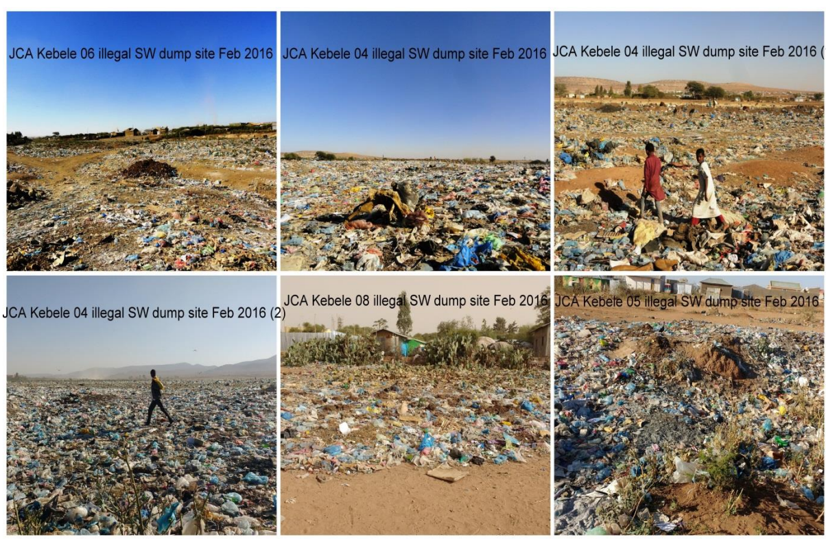
Photos 7-12: Different locations of unauthorised dumping across the city

On both official and illegal dumpsite, informal waste pickers are searching for important recyclable materials (metals) and scattered waste attracts dogs and rodents.