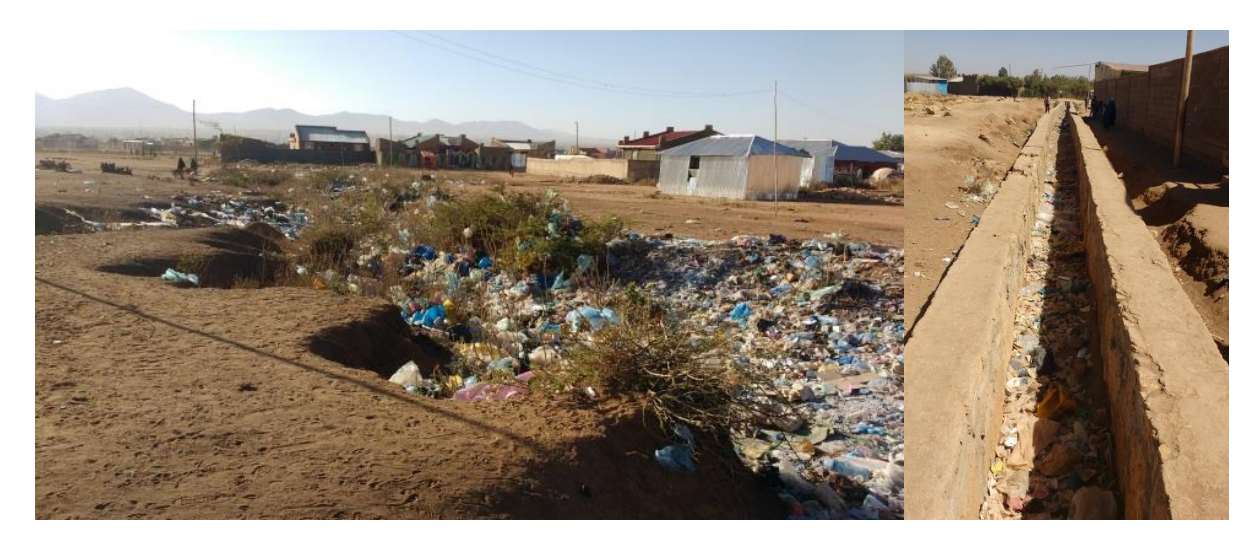
Photos 5-6: Unauthorised dumping on open ground and in drains in Kebele 7.