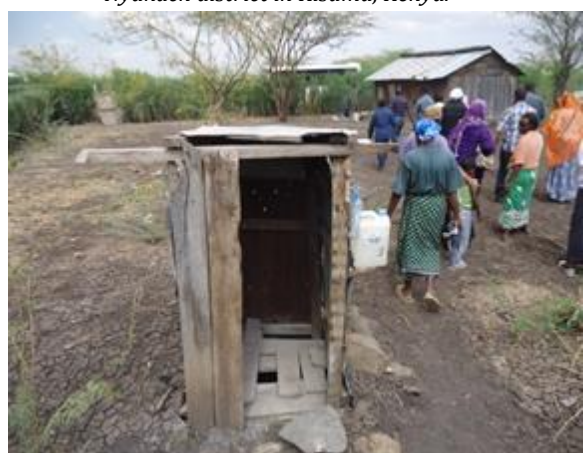
Photo 1: Simple latrine with hand washing facility in Nyakach district in Kisumu, Kenya.

Open defecation free is defined most basically as the absence of the practice of open defecation in a prescribed community, region or nation. Implicitly it means that all members of that community have access to and are using a latrine. The translation of the definition into monitorable indicators is where we see the reflection of priorities