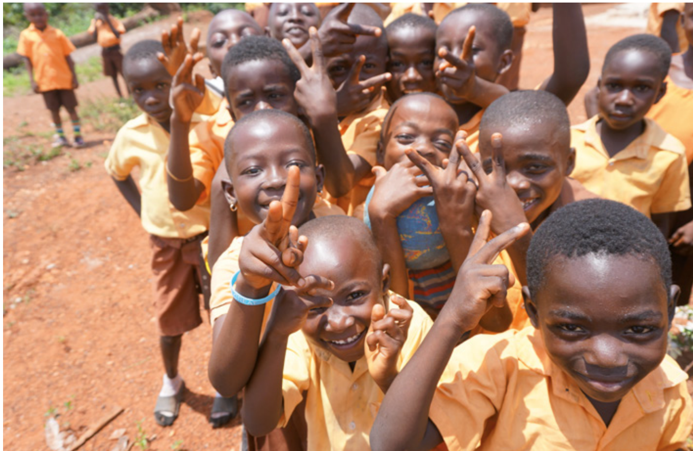
School children of Asutifi North, Ghana.

Evidence plays a key role in influencing. Advocacy needs to be based on reliable evidence. In Watershed, evidence is needed, for example, to successfully influence policies and WASH financing (budget allocation and spending). Similarly, CSOs need to analyse policy to gain an understanding of policies and regulations before they engage in actual influencing. In all policy influencing efforts, the local situation needs to be appreciated because the individual contexts differ and will largely determine the specific strategies. Good advocacy practices, for example on how to bring accountability to national dialogues, need to be documented so that others can learn from and build on them.