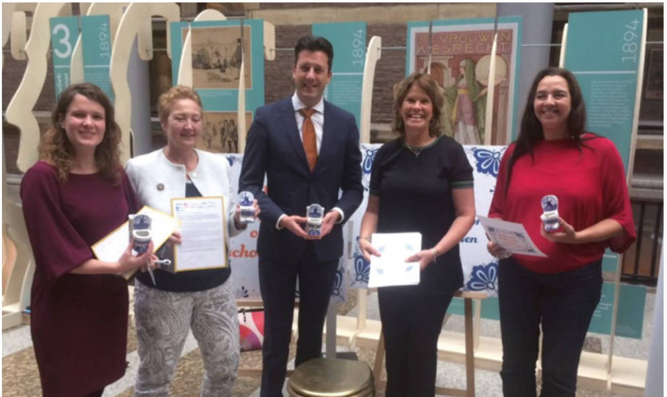
Dutch members of Parliament and the Managing Director of Simavi holding their toilets after the 'Manifesto on Sanitation' written by Simavi and signed by 12 other NGOs was presented on 21 November in The Hague, the Netherlands.

On 4 December 2018, the Dutch Parliament adopted a Resolution with a two thirds majority (agreed by 10 political parties) calling on Minister Kaag of Foreign Trade and Development Cooperation to publish a credible and ambitious plan for achieving the sanitation goals for the period 2020 to 2030 and its associated budget estimation, and inform Parliament accordingly. Minister Kaag promised to deliver the plan in the autumn of 2019 with the Budget 2020 proposal. Information on the Resolution in Dutch: https://www.sgp.nl/actueel/iedereen-de-pot-op/9947 .