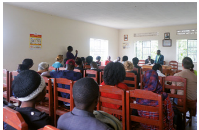
Watershed partners welcomed by the district chairperson of the Kabarole District, during the partnership meeting in Uganda, October 2018.

A relevant question at this stage is whether Watershed is too focussed on the WASH/IWRM sector, and whether zooming out to work with CSOs outside this sector would contribute to generating more systemic change.