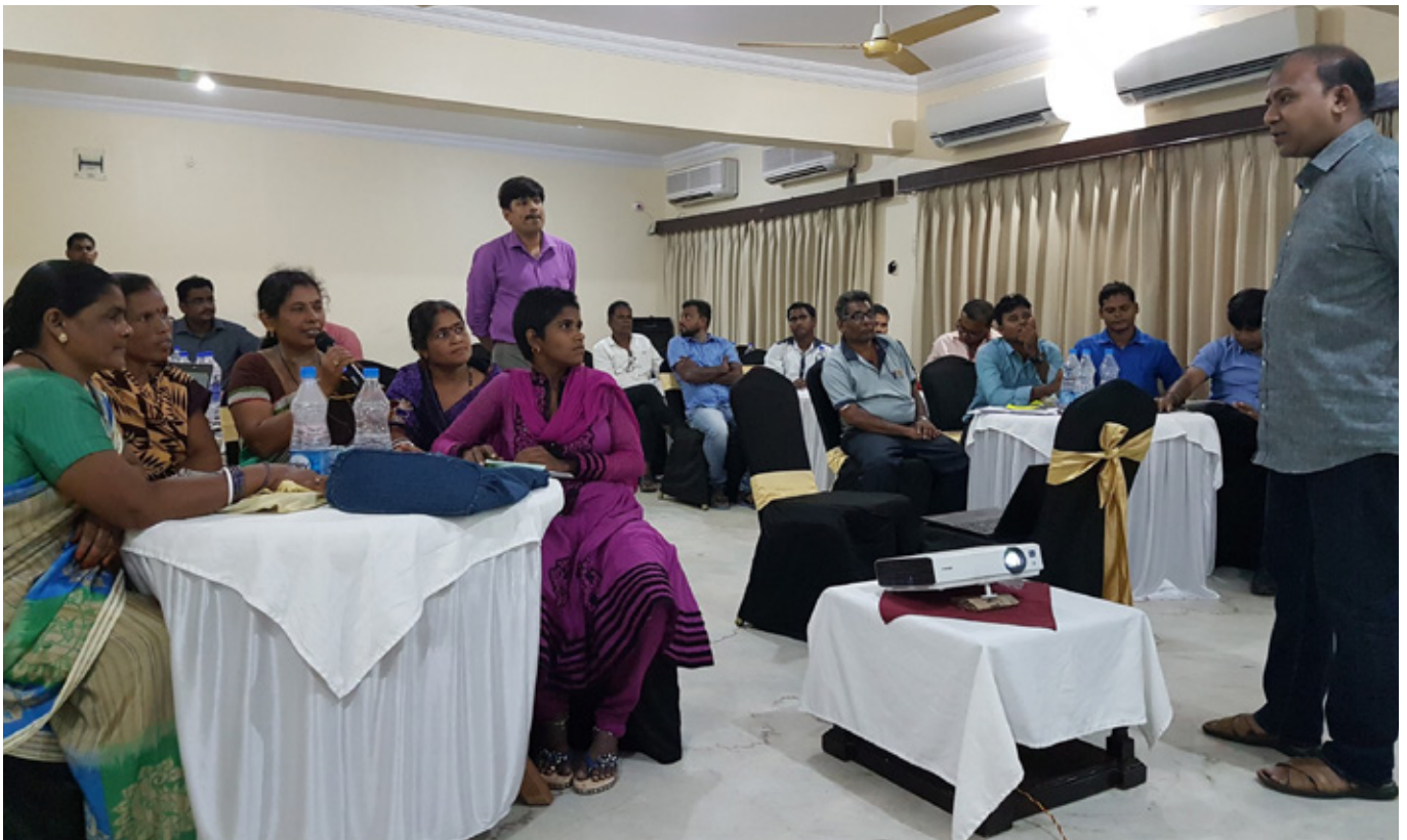
Capacity building of CSOs on budgets in Gopalpur, Odisha, 4-6 June 2018. The parties involved include: IRC, Centre for Budget and Governance Accountability (CBGA), local CSOs, village Panchayati Raj Institutions, the Village Water And Sanitation Committee and Village Development Committees.

This is a case of how a failure to invest in community capacities and ill-defined processes can lead to poor implementation of WASH schemes. It is also an example of how a CBO can hold relevant line departments accountable for services, potentially leading to a more responsive local government. The Village Committee is now aware of its role and is taking responsibility.