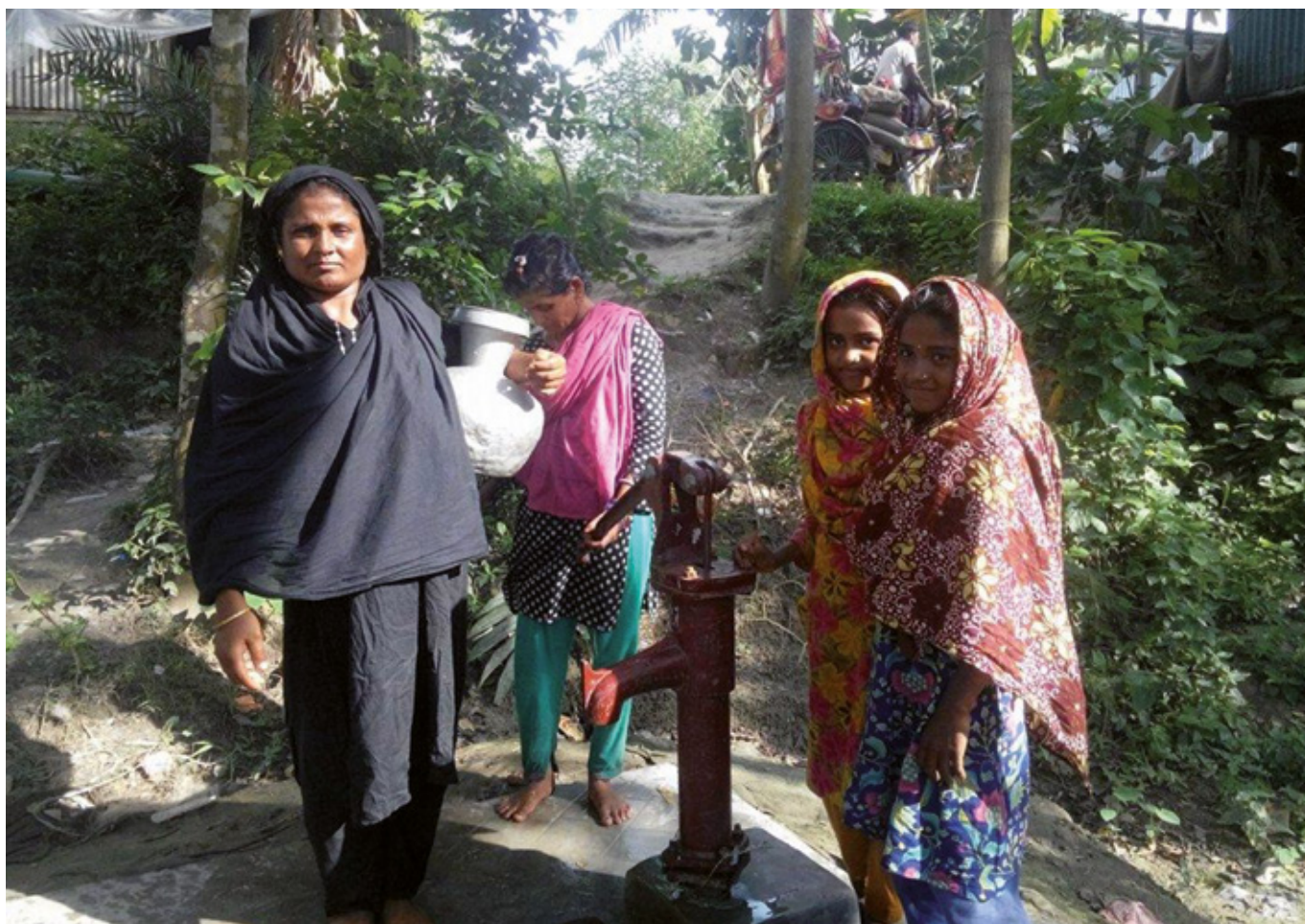
Bangladesh 'Bede' Community using the tube well near river bank at Dhania Union that was installed in August 2018.