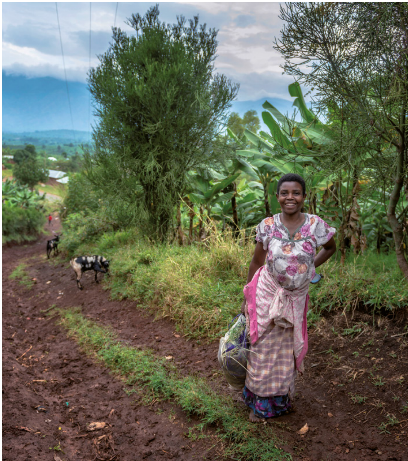
Fort Portal, Uganda.

Watershed partners need to use the remaining implementation period to invest in ensuring that CSOs will be able to do effective evidence-based L&A after Watershed, thereby making the programme results sustainable. Empowering and strengthening the advocacy capacity of CSOs should go hand-in-hand with more diplomatic efforts to keep the civic space open. They should also bring about an enabling environment for civic participation through the creation of formal platforms where they do not exist or enacting platforms that exist on paper but are not operational.