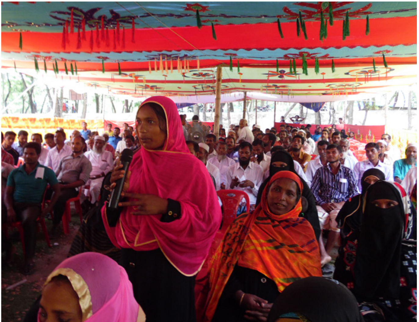
Community discussions at Veduria Union, Bangladesh.

The Netherlands' new development policy of 'Investing in Perspective' clearly acknowledges the shrinking space for CSOs and the role CSOs play in development.