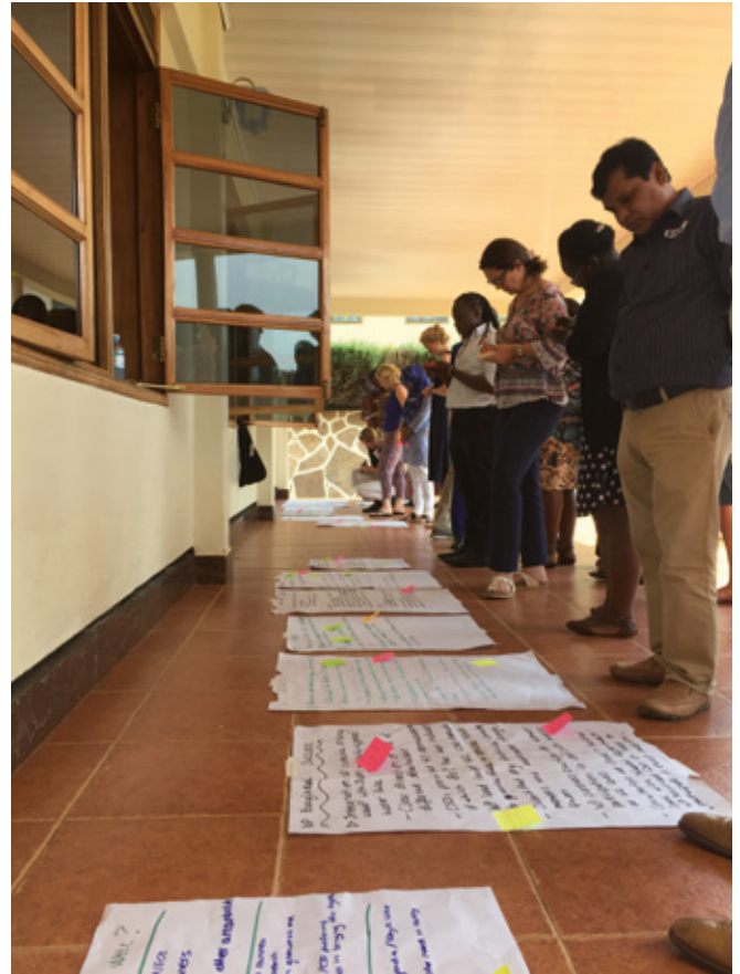
Watershed partners sharing experiences during the annual partnership meeting of October 2018 in Uganda.

Lack of scale. Most of the outcomes focus on concrete, local level changes with local level governments. The linkage between local and national level is, as yet, not always made. The teams are aware of this lack of scale and are taking measures to put greater focus on the bigger context.