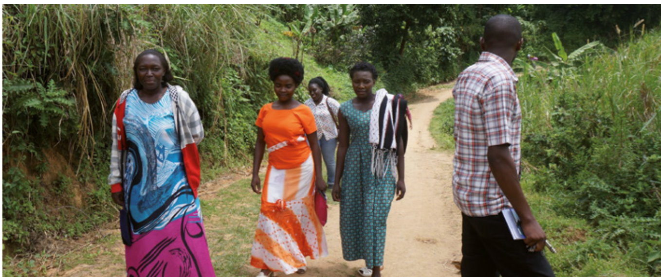
Women at the banks of River Mpanga, Fort Portal, during the October 2018 Watershed Partnership meeting.

The most outstanding outcome for the consortium was the successful engagement of political and technical leaders mainly at district level, resulting in commitments to act on improving water quality and safety for domestic consumption. This was particularly the case in Kabarole District where, following a water quality survey, district leaders acknowledged that the rampant contamination of water sources was due to poor household sanitation practice. As such, the district leaders agreed to promote water safety planning as the approach to improve water quality. Additionally, the political leaders accepted to promote the construction of household sanitation facilities to reduce the level of E-coli contamination.