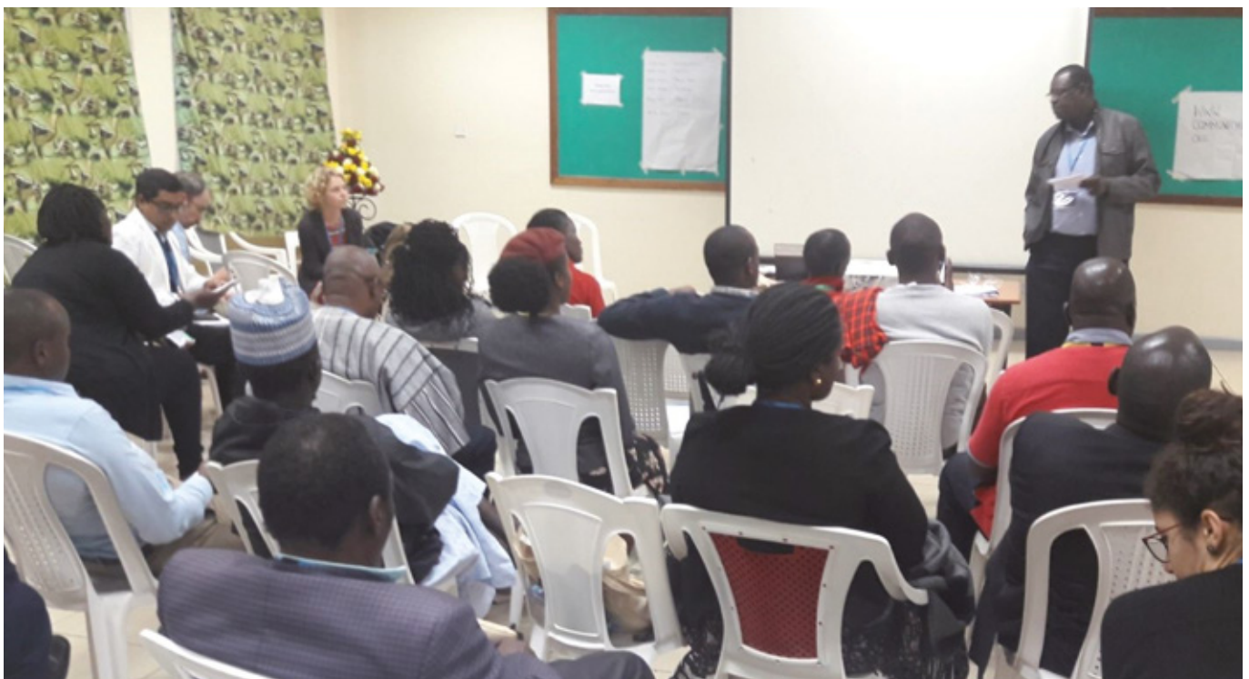
Watershed partners in Kenya hosting an event to discuss 'Universal and equitable access to sustainable Water, Sanitation and Hygiene (WASH) services for all by 2030: Can CSOs ensure that no-one is left behind?' on Wednesday 11 July 2018 during the WEDC International Conference.

This public declaration of the Governor's support for WRUAs will facilitate the effective delivery of WRUA functions such as water use monitoring. The conference strategically incorporated the views of Citizen Groups. The voice of the citizens was at the forefront for the first time. The conference provided a platform to showcase WRM/ WASH integration in practice.