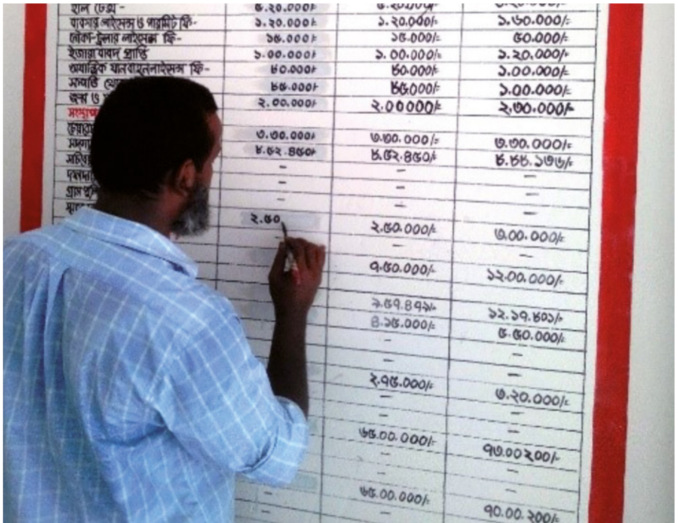
The Budget of Union Parishad being written on the wall of the Union Parishad for sharing and ensuring transparency and accountability.

Sadar Upazila (subs-district) Chairman and a Department of Public Health Engineering (DPHE) 6 representative were present. Seventy-five community members, including representatives of marginalised groups and women got the space for the first time to voice their demands during these budgeting platforms. The Bhola Sadar Upazila Chairman committed to increase the WASH budget at the meeting. Union Parishad public WASH budget was consequently increased by 14% in Veduria Union and 40% in Dania Union and incorporated community demands.