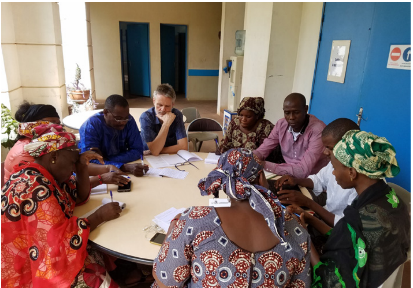
Watershed partners in Mali in discussion during accountability workshop, May 2018.

The cooperation between the 36 CSOs is paving the way for citizens to develop a sense of ownership of their physical environment, more specifically of their household waste disposal and the quality of their water sources. To this end, the negative impacts of human activities were made more visible, and the data was openly shared by and with the first users and those affected by pollution. The cooperation also strengthens the work of CN-CIEPA in getting the voices of people with inadequate services and resources heard.